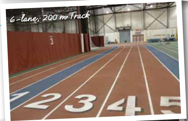
6-lane, 200 m Track