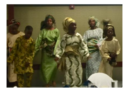
Dancers at CCR Banquet

The City of Saskatoon sat on the advisory committee for the CCR consultation from summer 2015 to June 2016. There were upwards of 350 delegates from across Canada in attendance. The City also took part on a panel and presented on the topic of "Creating a Welcoming Community in Saskatoon". There were approximately 60 people in attendance.