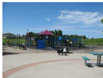
Ernest Lindner Park