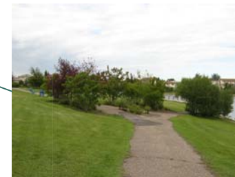
John Avant Park