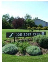
Don Ross Park