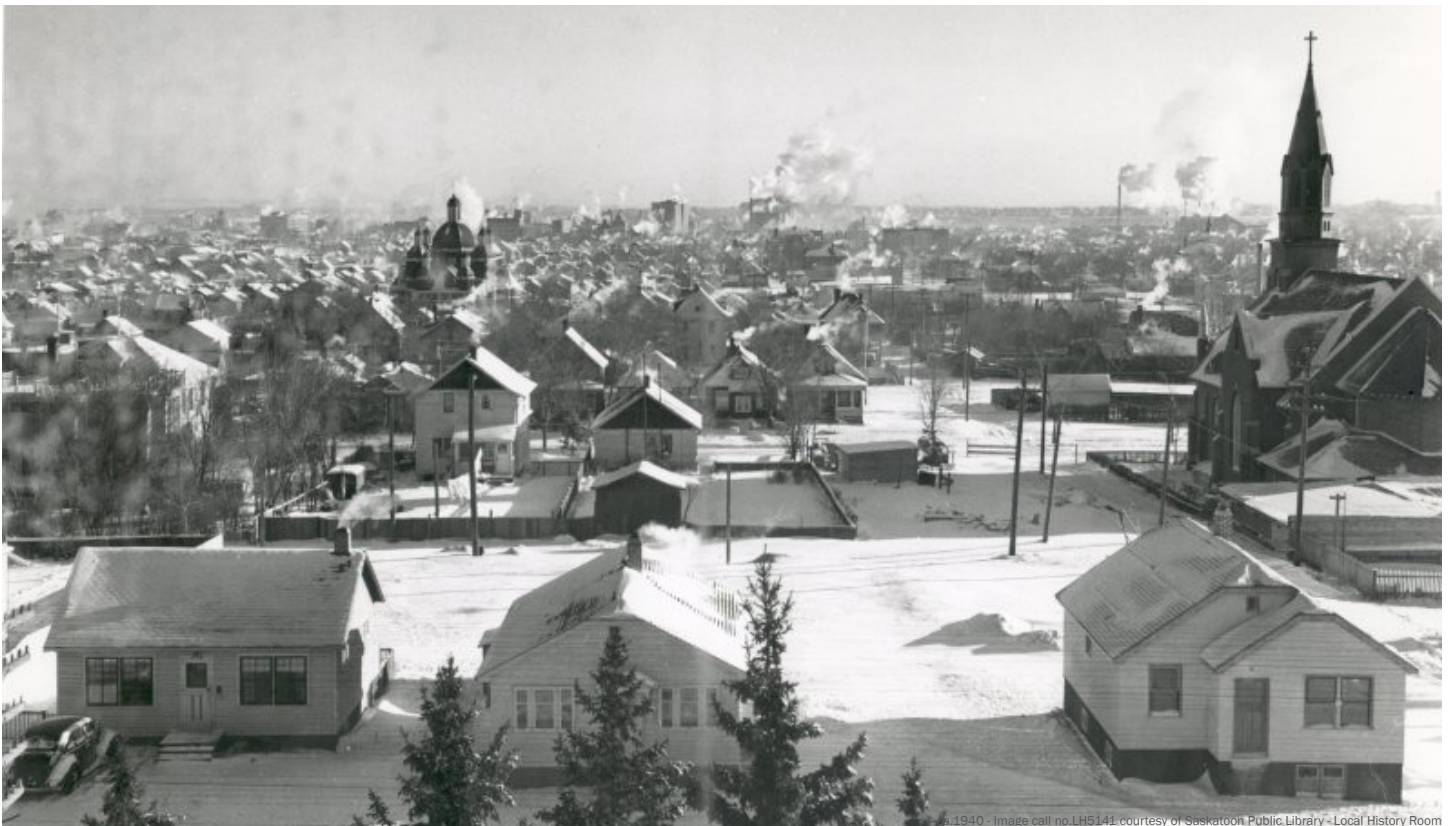
Riversdale looking east from St. Paul's Hospital, St. Mary's Church at Avenue O South and 20th Street West at right. St. George's Ukrainian Greek Catholic Cathedral can be seen on Avenue M South.