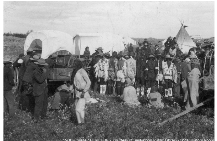
1900 - Image call no. LH85 Aboriginal encampment including covered wagons.

The 1885 North West Resistance left the colony largely unscathed. Indeed, it was the source of a much-needed economic boost, providing both employment to the settlers and a lucrative market for their surplus agricultural products. At the same time, many prospective new settlers were scared away by sensationalised newspaper reports back east, and Saskatoon’s future seemed less than assured.