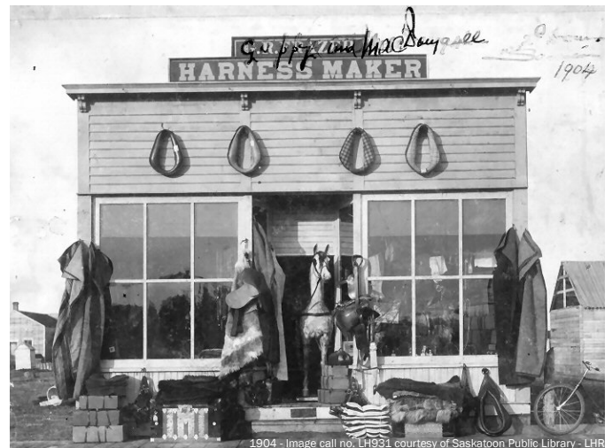
1904 - Image call no. LH931 courtesy of Saskatoon Public Library - LHR G.R. Frazer's harness shop in 1904.