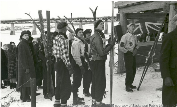
ca.1940 - Image call no. PH96-177-5

Kong Lee store interior probably at 101 - 2nd Avenue South (it had been at 204 - 2nd Avenue North in the late 1930s.