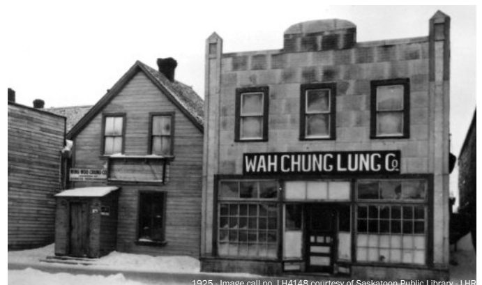
1925 - Image call no. LH4148 courtesy of Saskatoon Public Library - LHR Chinese businesses in 1925 including Wah Chung Lung Co. and Wing Woo Chung Co. on 19th Street East between 1st and 2nd Avenues.

In its early years, Saskatoon was Canada's fastest growing city. The next great boom came after World War II.