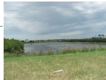
R.C.A.F. Memorial Park