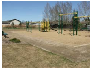
Claude Petit Park