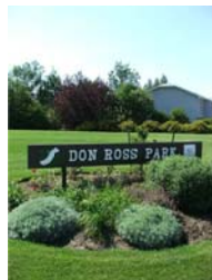
Don Ross Park