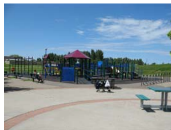
Ernest Lindner Park