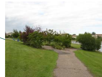
John Avant Park