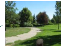
Albert Milne Park