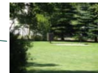
St. Patrick Park