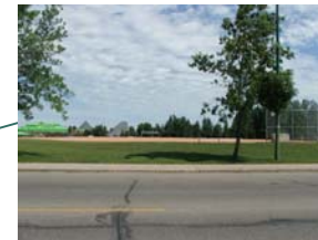
Bishop James Mahoney Park