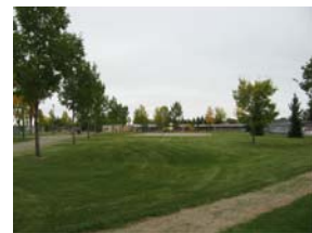
Archibald McDonald Park