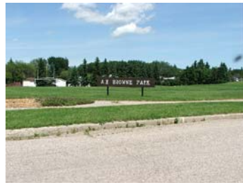
A. H. Browne Park