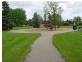
Lt. Gen. G.G. Simonds Park