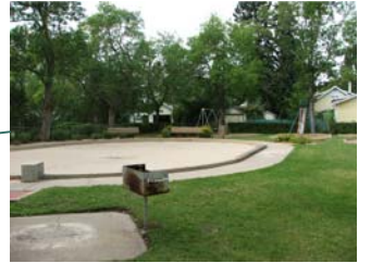
Albert Recreation Unit