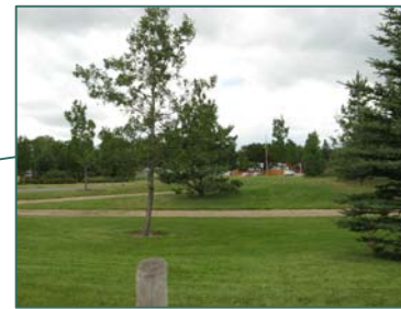
Harold Tatler Park North