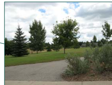
Harold Tatler Park South