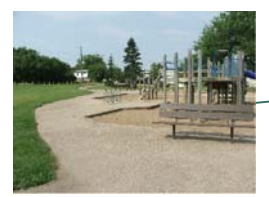
Pleasant Hill Park