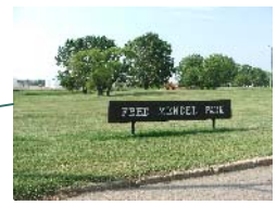
Fred Mendel Park