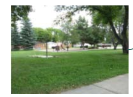
D.L. Hamilton Park