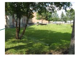
Steve Patola Park