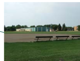
G.D. Archibald Memorial