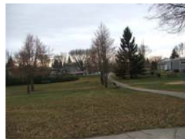
G.D. Archibald West