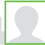
Vacant Community Consultant 306-975-2952