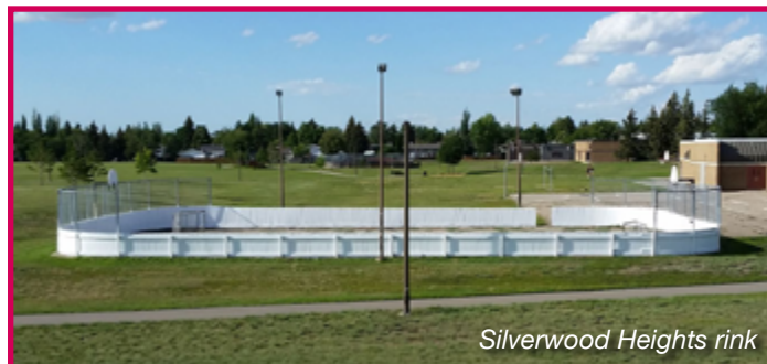
Silverwood Heights rink