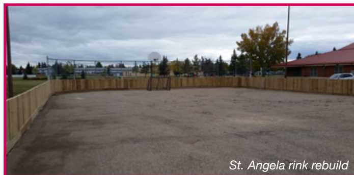
St. Angela rink rebuild