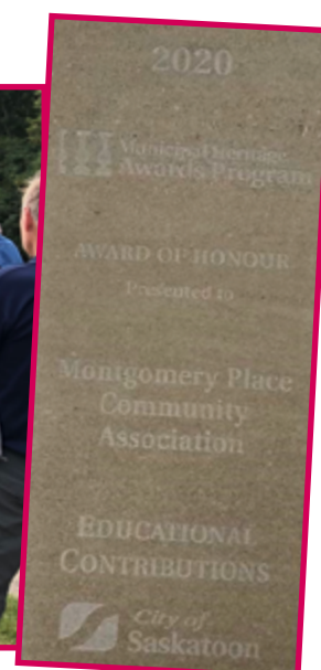
Left: Back view of Opening Ceremony. right: Municipal Heritage Plaque