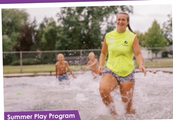
Summer Play Program

The City of Saskatoon is looking for energetic people to work as Recreation Program Leaders during the summer season.