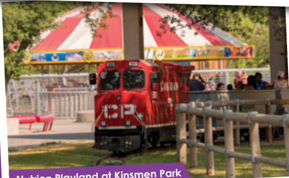
Nutrien Playland at Kinsmen Park