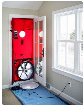
Figure 2: Blower door test

Before sealing any leaks in your home, it is important to have a registered Energy Advisor perform an EnerGuide audit, which includes a Blower Door Test, and determines how much air flows through your home. Airtightness is measured by placing a depressurizing fan inside one of the doors and pulling air outside of the home to force exterior air to come back in through any holes, cracks, or gaps, and measuring the flow of the incoming air with a pressure gauge. Air leakage is measured in air changes per hour at 50 Pascals (ACH@50Pa). The fewer air changes per hour, the more air-tight the building envelope is.