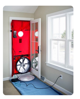
Figure 2: Blower door test

Before sealing any leaks in your home, it is important to have a registered Energy Advisor perform an EnerGuide audit, which includes a Blower Door Test, and determines how much air flows through your home. Airtightness is measured by placing a depressurizing fan inside one of the doors and pulling air outside of the