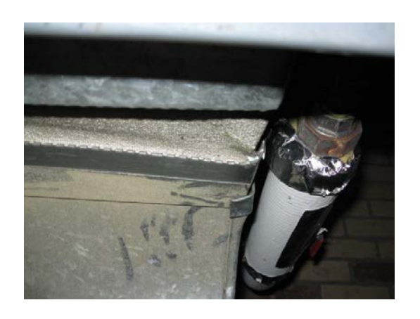
#5) Duct Expansion Gasket