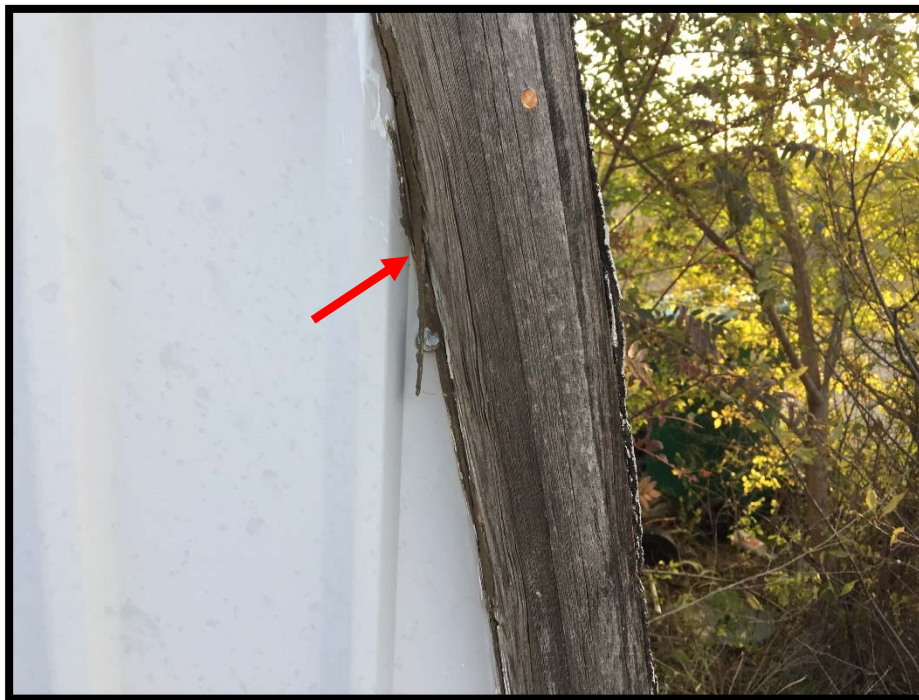
Photograph 1: Asbestos-Containing Brown Building Caulking.

\\golder\gal\edmonton\active\2016\3 proj\1667963 cityofsaskatoon_asbsurveys_saskatoon\07 reports\64 - landfill quonset storage\appendix b - landfill quonset storage - site photographs.docx