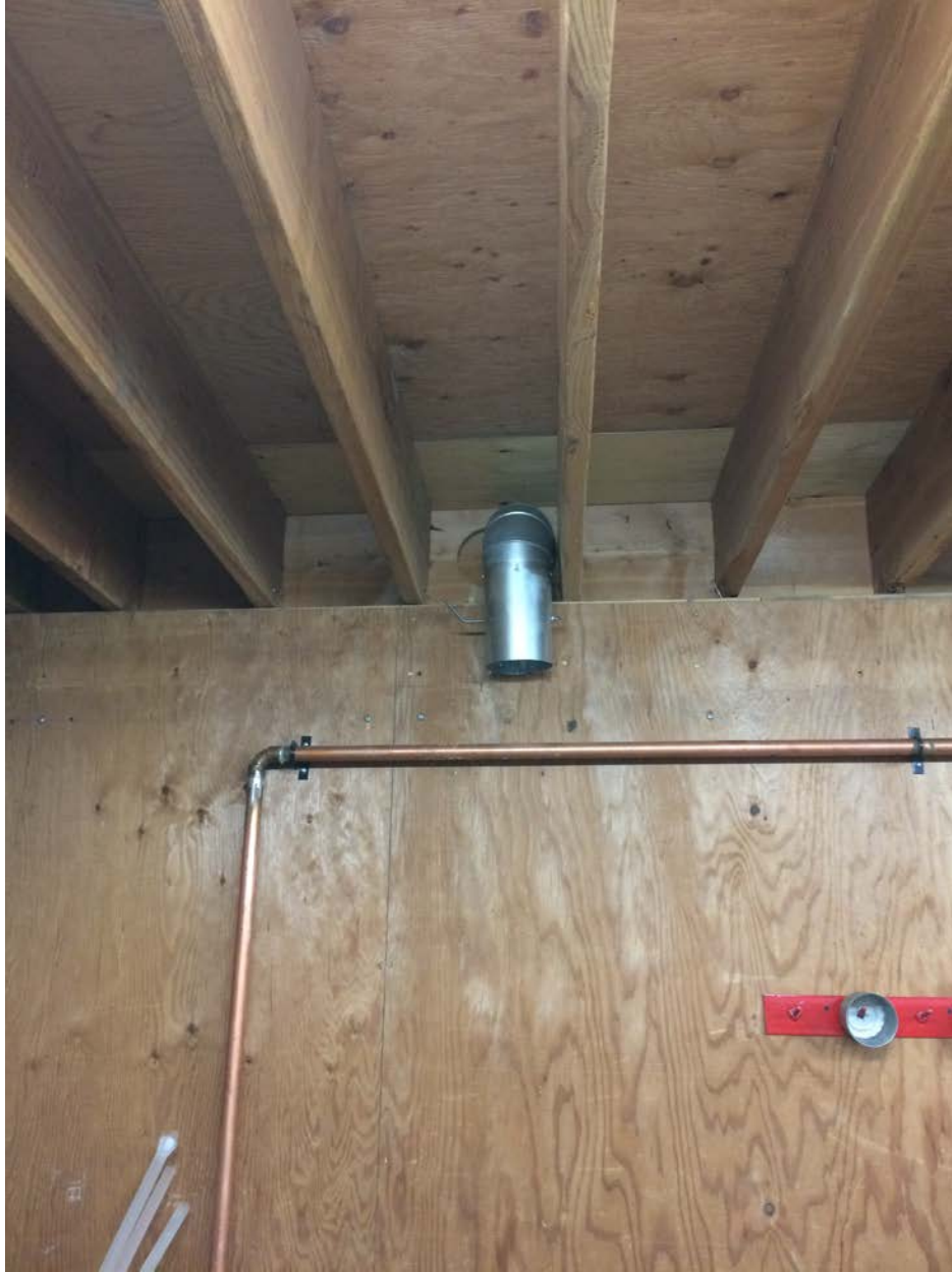
Figure 2- Exterior wall of storage room showing existing vent to be used.