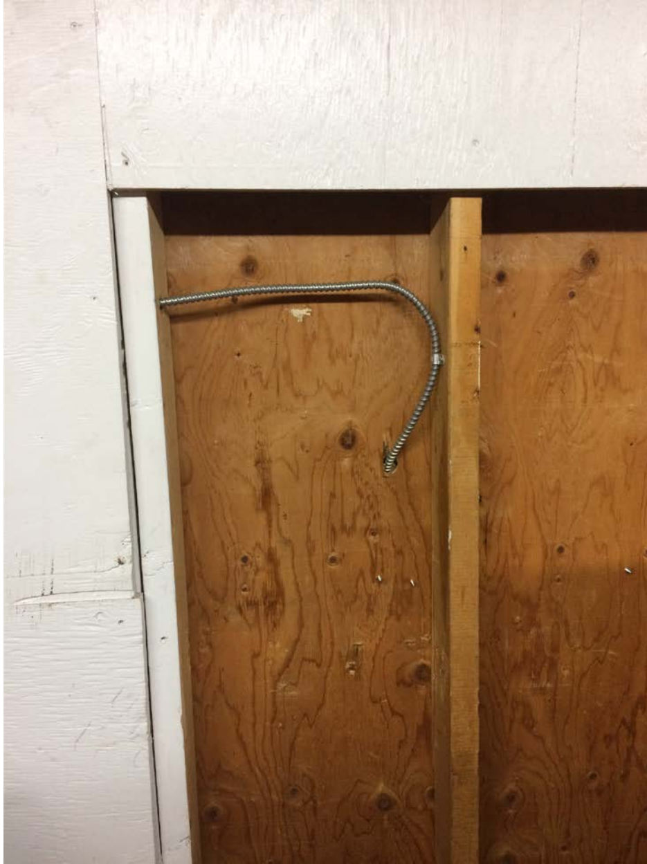
Figure 1- Wall adjoining storage room and maintenance shop where vacuum is to be mounted.