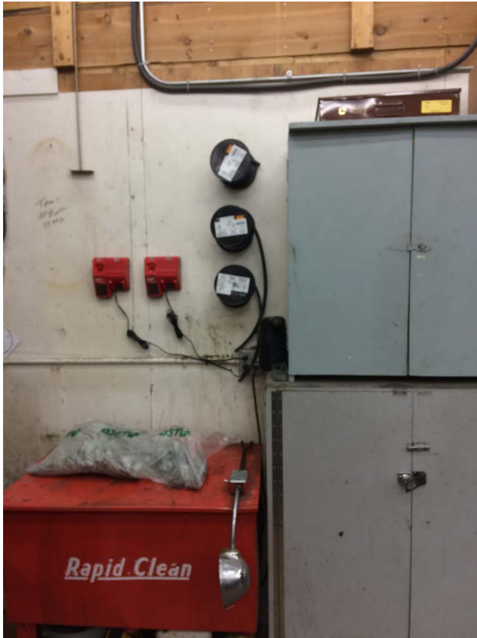
Figure 3- Wall adjoining maintenance shop and storage room.