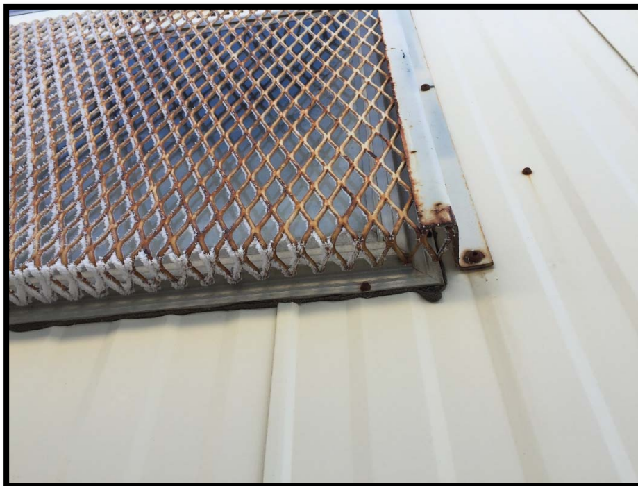
Photograph 2: Asbestos-Containing Black Building Caulking.