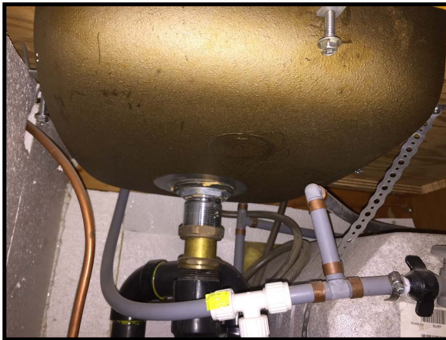
Photograph 1: Asbestos-Containing Gold Sink Undercoat.