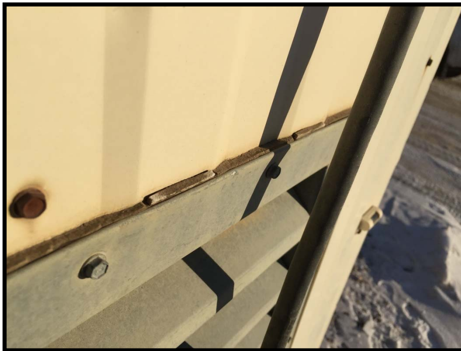
Photograph 3: Asbestos-Containing White Building Caulking.

\\golder\galledmonton\active\2016\3 proj\1667963 cityofsaskatoon_asbsurveys_saskatoon\07 reports\123 - trailer 707\appendix b - site photographs.docx