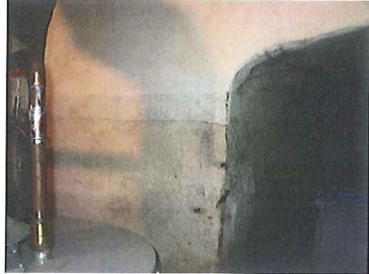
#2) Duct Insulation