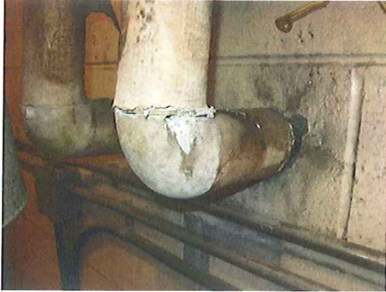
#1) Pipeline Fitting