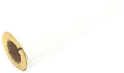
#2) Pipeline Insulation