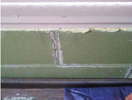
#1) Wall Parging Material