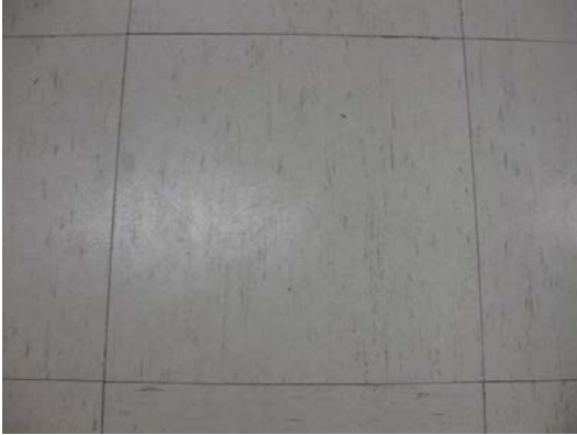
#1) Floor Tile