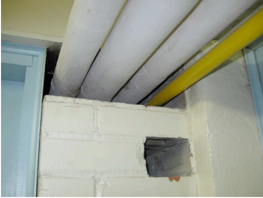
#1) Mortar at Pipe Penetration