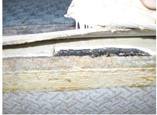
#2) 1' X 1' Floor Tile