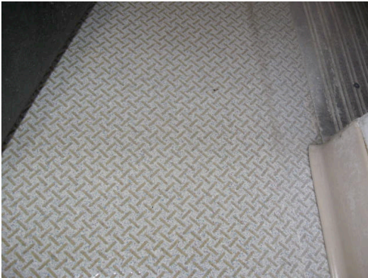
#3) Sheet Floor Covering