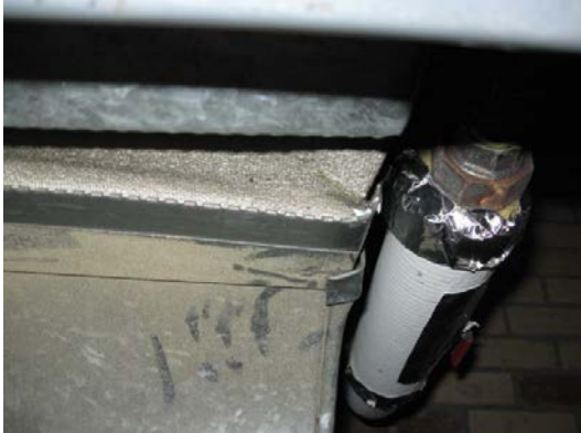
#5) Duct Expansion Gasket