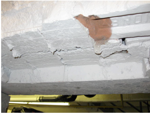
#1) Brick Mortar