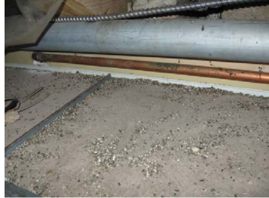
#2) Vermiculite Insulation