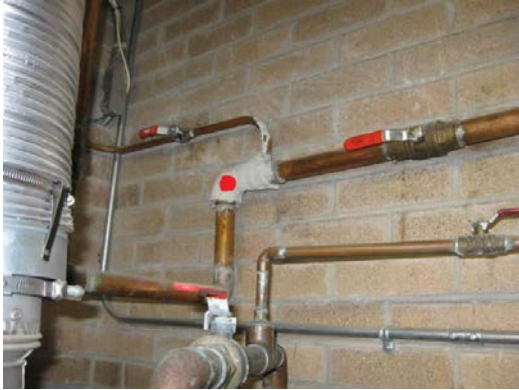
#1) Pipeline Fitting