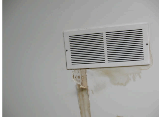
#4) Drywall Mud Compound