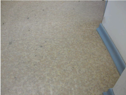
#3) Sheet Floor Covering