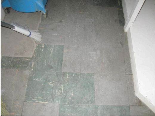
#1) 9" X 9" Floor Tile