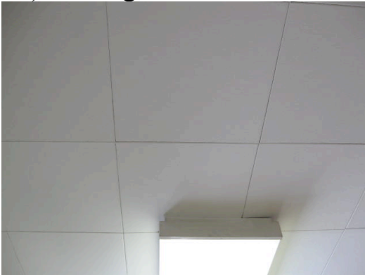
#5) Ceiling Tiles