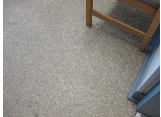
#2) Sheet Floor Covering