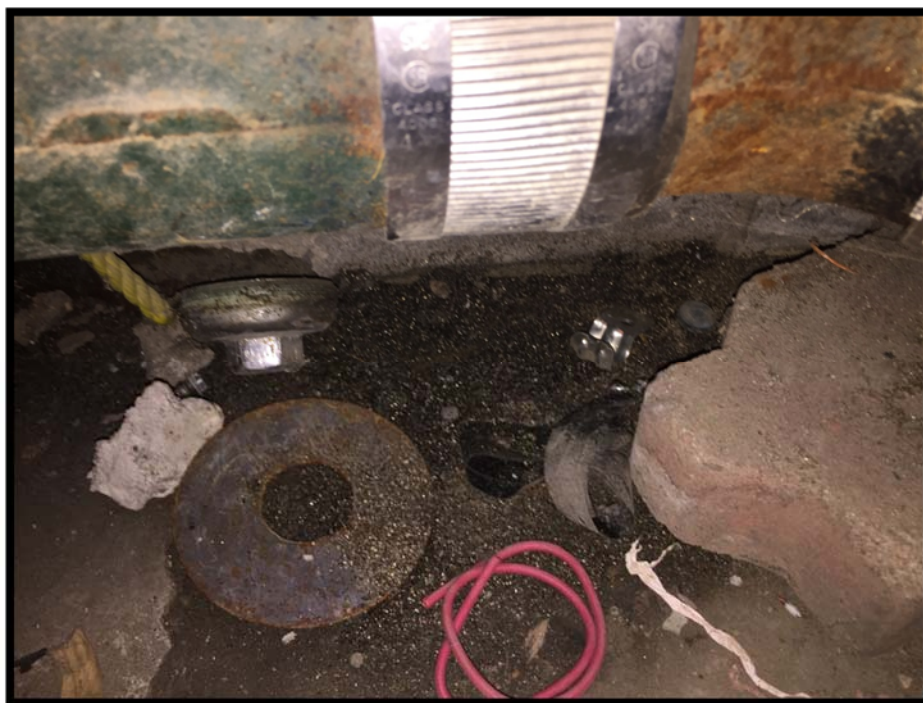
Photograph 1: Asbestos-Containing Vermiculite Debris.

\\golder\gal\edmonton\active\2016\3 proj\1667963 cityofsaskatoon_asbsurveys_saskatoon\07 reports\18 - rotary park washrooms\appendix b - site photographs.docx