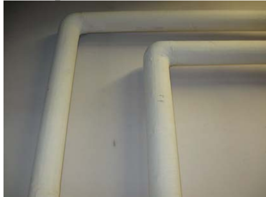
#4) Pipeline Insulation