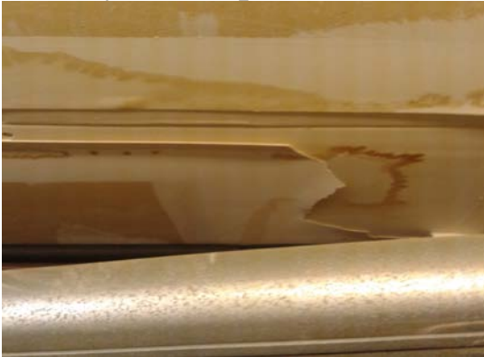
#3) Drywall Tape/ Mud