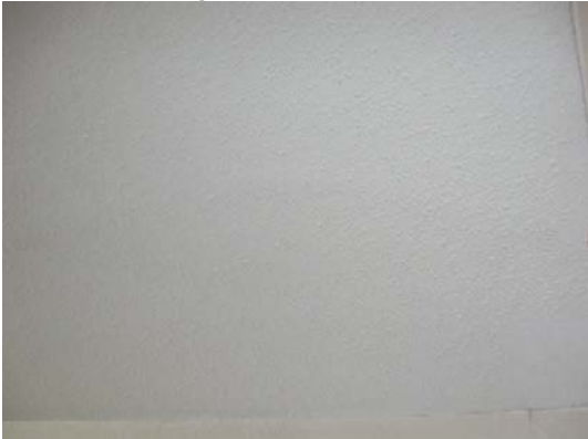
#5) Ceiling Board