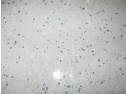
#1) Sheet Floor Covering