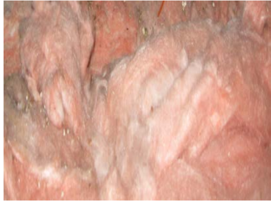
#2) Attic Insulation