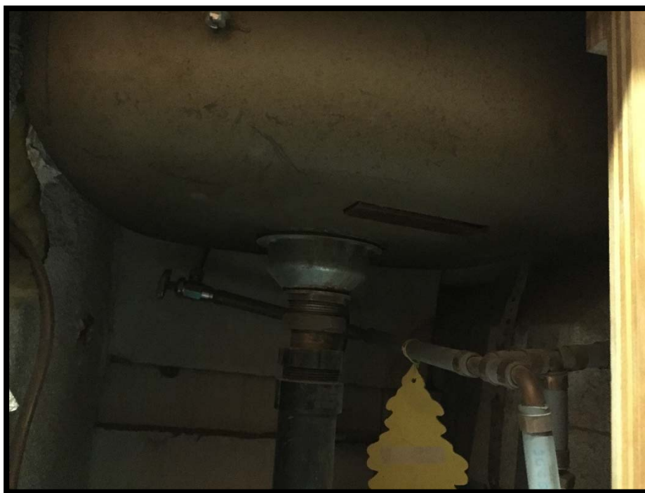
Photograph 1: Asbestos-Containing Gold Sink Undercoat.

\\golder\galliedmonton\active\2016\3 proj\1667963 cityofsaskatoon_asbsurveys_saskatoon\07 reports\126 - trailer 711\appendix b - site photographs.docx