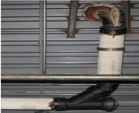
#2) Transite Pipe