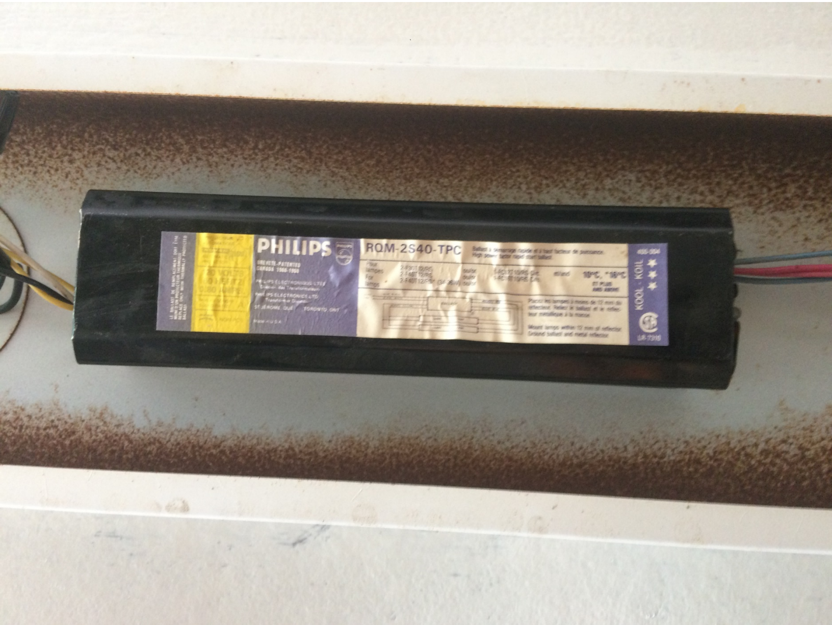
Photo 006- Non-PCB Light Ballast- Unit 007