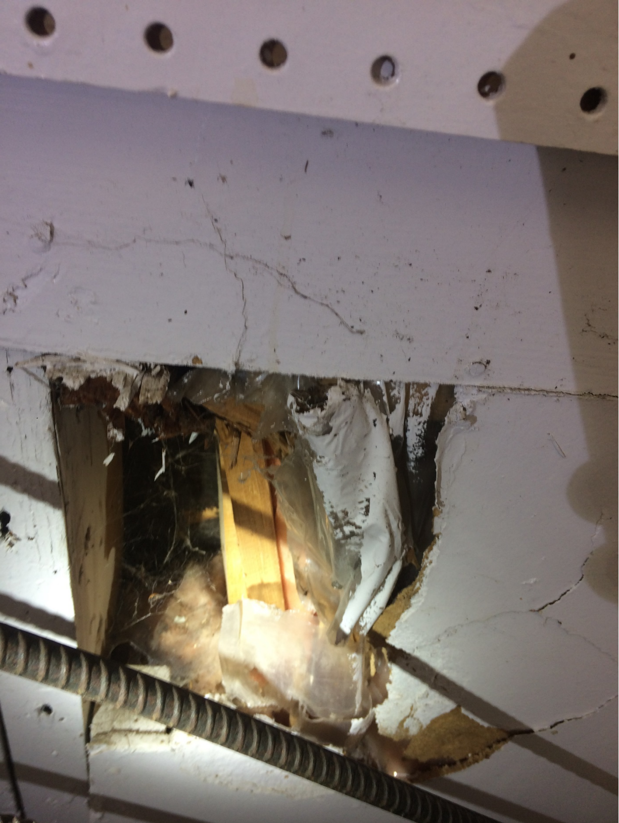
Photo 004- Wall Insulation- Unit 107