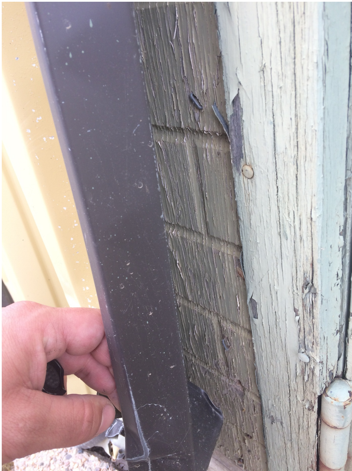
Photo 002- Faux Brick Façade behind Metal Cladding