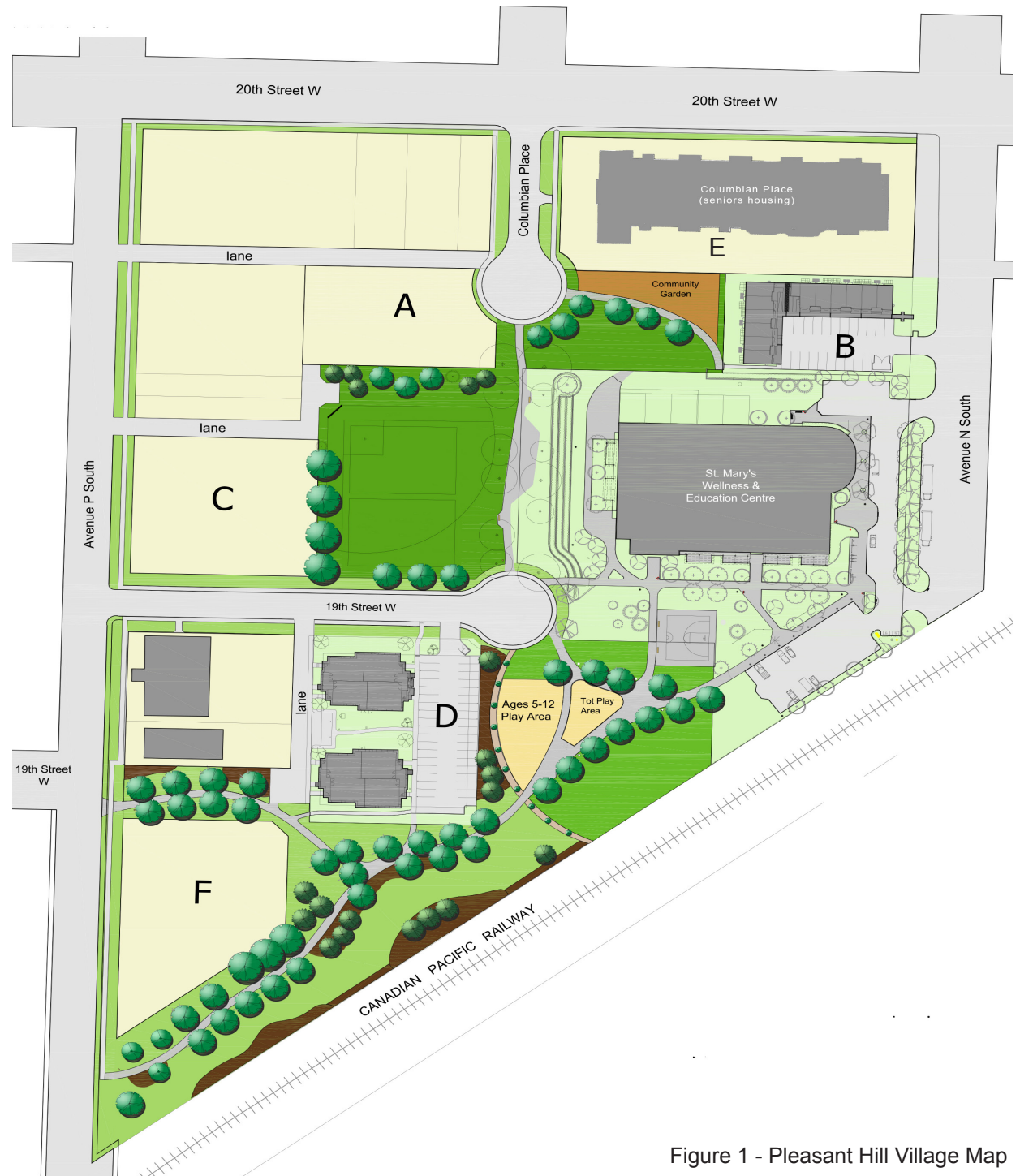
Figure 1 - Pleasant Hill Village Map

With an estimated project value of $50 million, Pleasant Hill Village is the largest neighbourhood renewal project in Saskatoon.