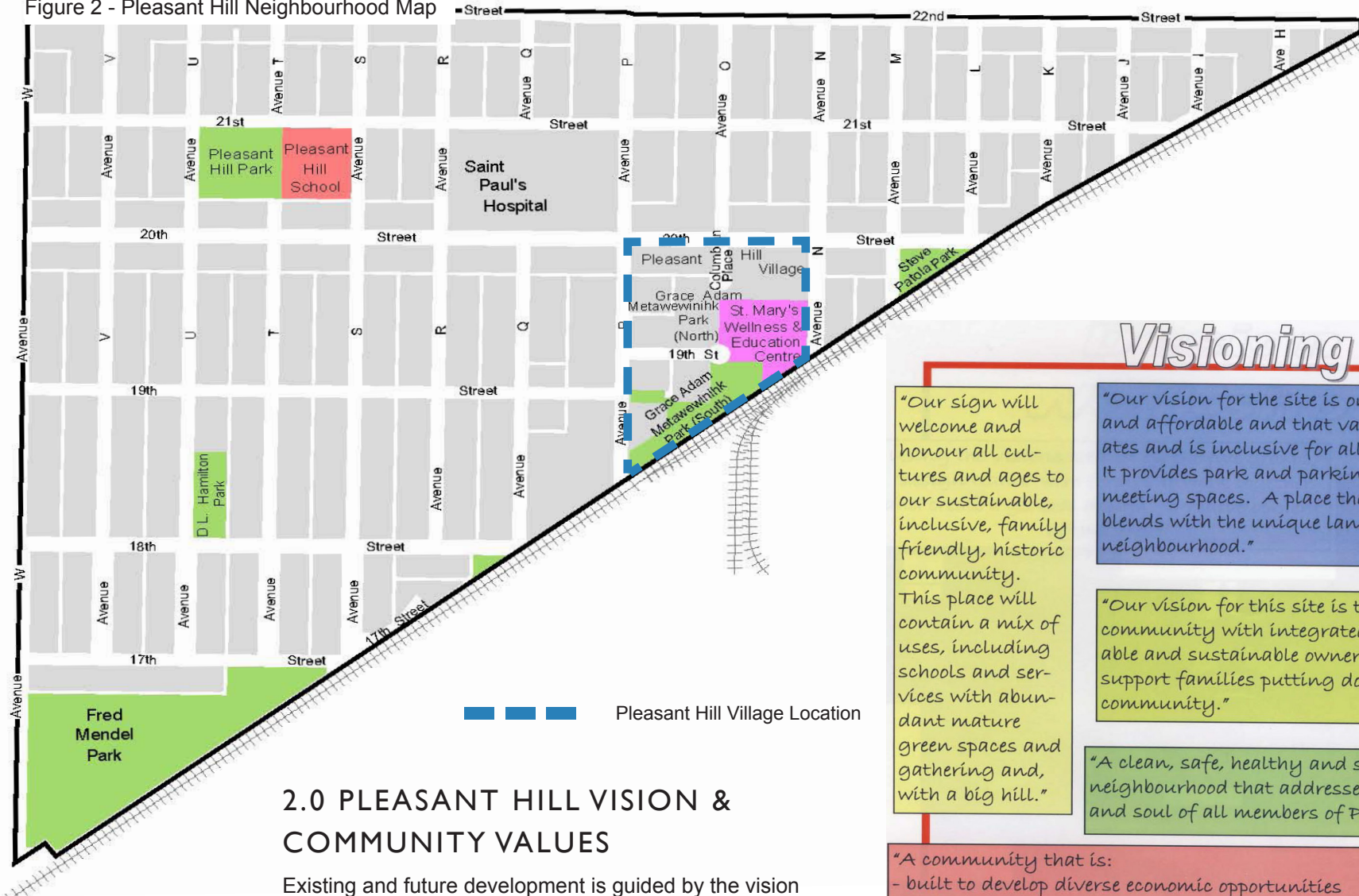
Figure 2 - Pleasant Hill Neighbourhood Map

— — — — — Pleasant Hill Village Location