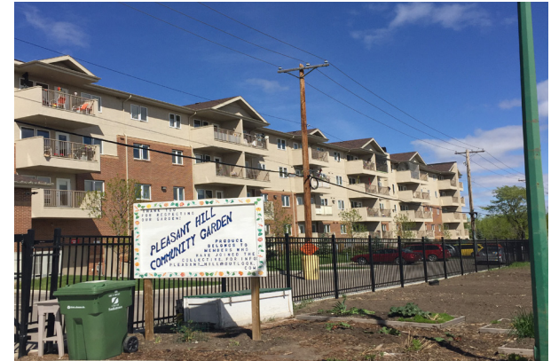
Pleasant Hill Community Garden

Pleasant Hill boasts vibrant cross cultural and multi-generational relationships where everyone comes together to help, share, support and encourage one another's physical, mental, emotional and spiritual growth