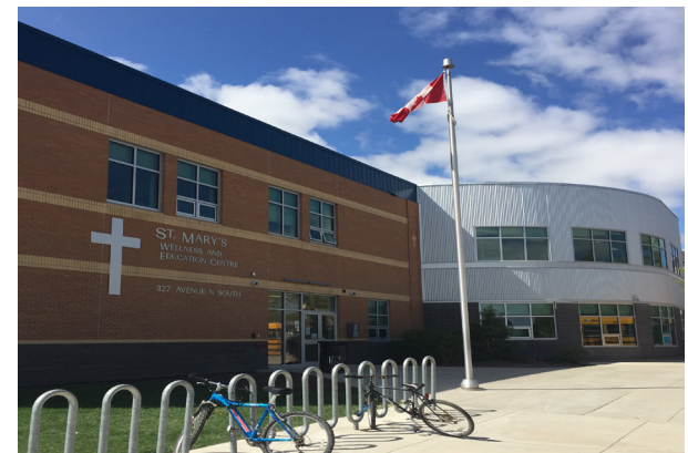
St. Mary's Wellness and Education Centre