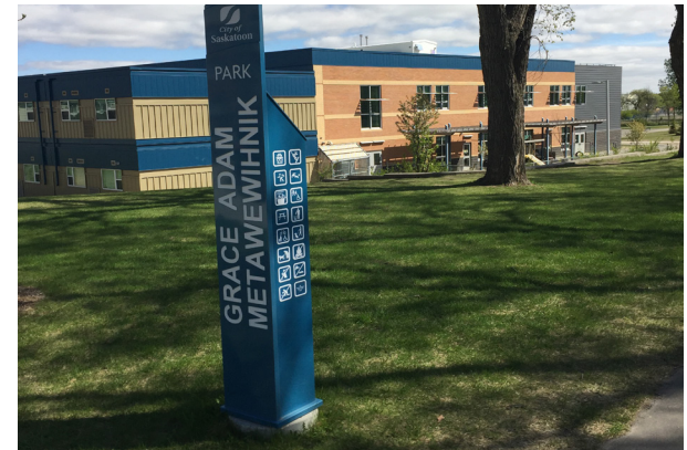
Grace Adam Metawewihnik Park