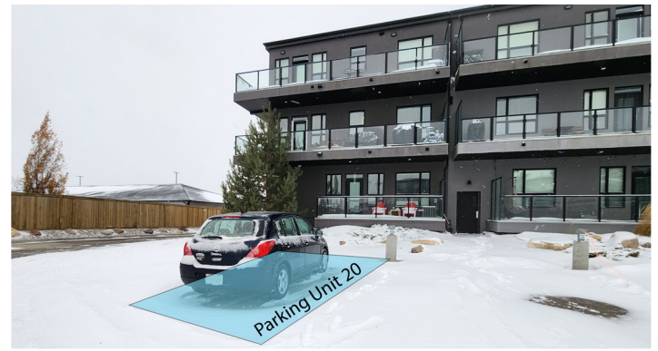
415 Maningas Bend Parking Unit 20 Above ground parking stall for condominium complex Zoning: RM3 Listing Price: $8,500