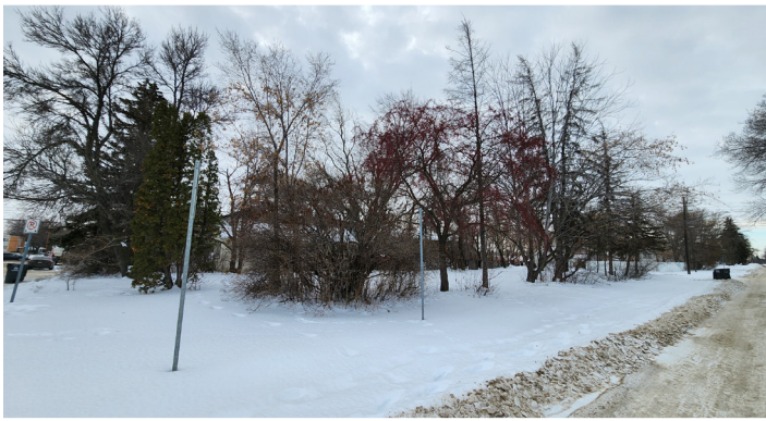
115 Avenue T N Parcel Size: 6,996 SF Frontage: 50' Zoning: R2 Listing Price: $81,000