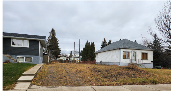
1915 William Avenue Parcel Size: 3,760 SF Frontage: 35' Zoning: R2 Listing Price: $210,000