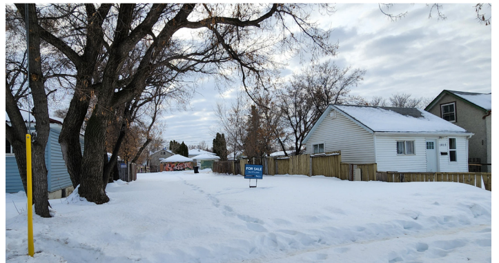
1013 23rd Street W Parcel Size: 4,874 SF Frontage: 37'5" Zoning: R2 Listing Price: $59,000