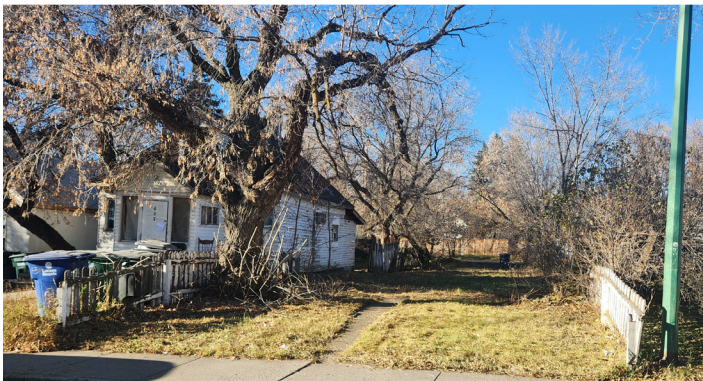
435 Avenue R S Parcel Size: 3,501 SF Frontage: 25' Zoning: R2 Listing Price: $30,000