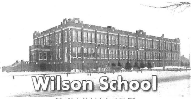
Wilson School as it looked when it was built in 1915