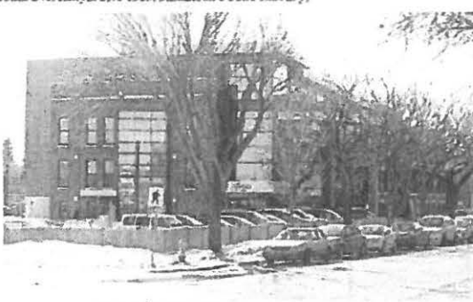
Wilson School is now home to Affinity Credit Union

er ones! Or do we need a middle groune? As planners, politicians and property owners try to answer these quartons, the concept of "adaptive reuse" ought to be considered. Adaptive reuse refers to the process of reusing an old site or building for a purpose other than the one it was built or designed for And many people have viewed it as a significant element in helf-land conservation and the reduction of urban sprawl