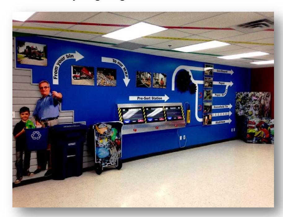
Loraas Education Room

From January to May, 2015, 4,023 tonnes of recyclable materials have been collected. The amount of garbage (contamination) collected by the program has averaged 3.5% since inception (January 2013). The residual rate continues to remain below the contract requirement of 5% and has been reported at 3.7%.