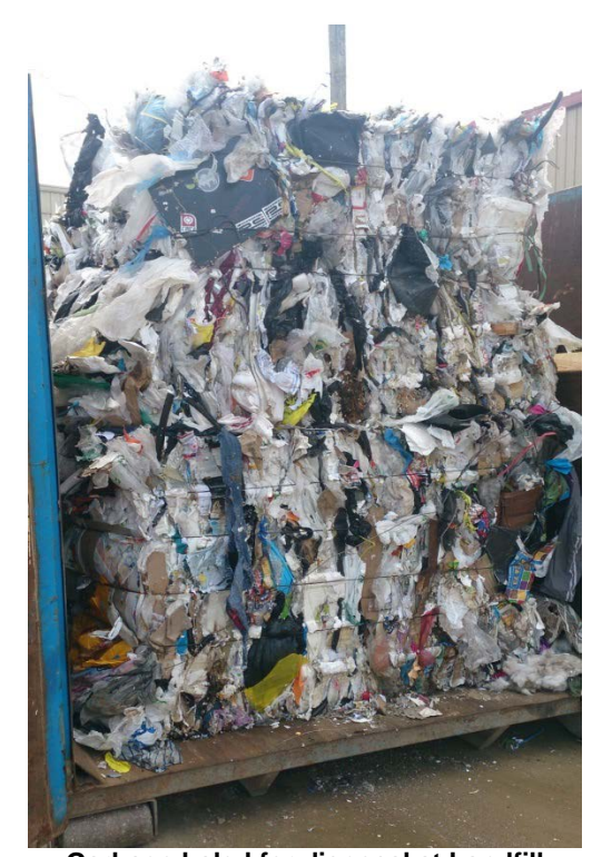
Garbage baled for disposal at Landfill