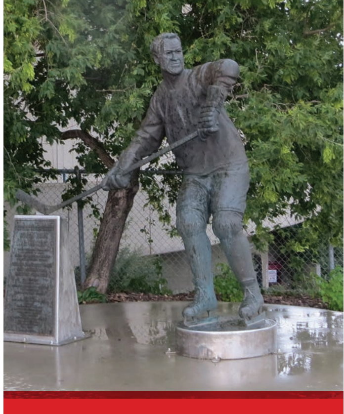
Gordie Howe's statue in its current location at SaskTel Centre, 2016.