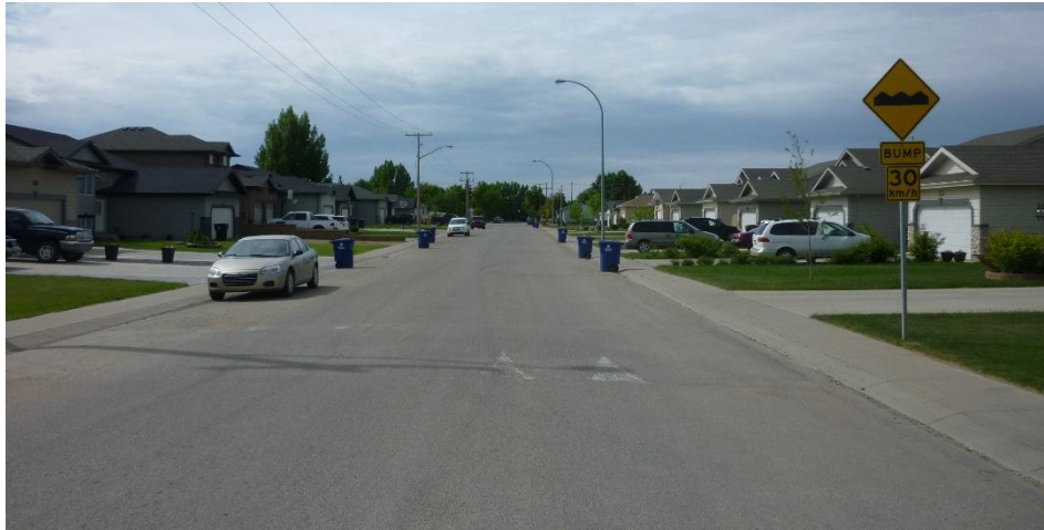
Figure 6.6 Speed Hump on Hughes Avenue (Dundonald Neighbourhood)

A speed hump is a raised area of roadway that deflects both the wheels and frame of a traversing vehicle. Speed humps should only be considered if other traffic calming measures are not applicable or if there is excessive speed on a street.