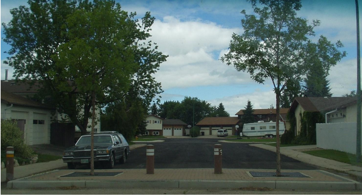
Figure 6.9 Coppermine Crescent and Churchill Drive (River Heights Neighbourhood)