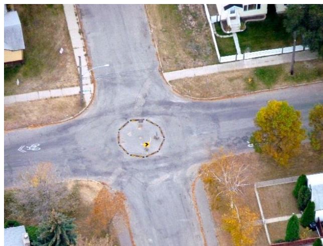
Figure 6.3 Temporary traffic circle on 23 rd Street (part of the Bike Boulevard)

A traffic circle would be recommended for local streets only.