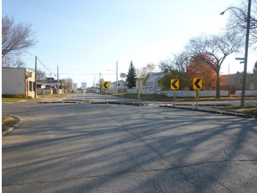
Figure 6.7 Avenue C and 38 th Street – Temporary Device (Mayfair Neighbourhood)

The purpose of a diverter is to obstruct shortcutting or through traffic.