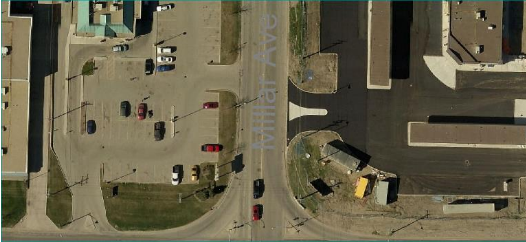
Figure 6.8 51 st Street and Miller Avenue (Hudson Bay Industrial Neighbourhood)