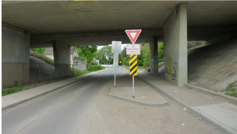
Figure 6.4 Saskatchewan Crescent (Nutuana Neighbourhood) Pinch Point on Saskatchewan Crescent indicating that traffic must yield to oncoming traffic.

A choker is a curb extension at midblock or intersection corners that narrow a street by extending the sidewalk or widening the planting strip. It can leave the cross section with two narrow lanes or a single lane. Chokers are often referred to as parallel chokers, angled chokers, twisted chokers, angle points, pinch points, or midblock narrowing. When at intersections, they are often referred to as neckdowns, bulbouts, knuckles, or corner bulges. If marked as a crosswalk, they are also called safe crossings.