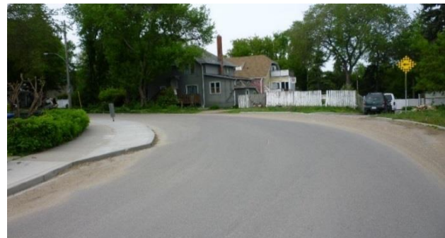
Saskatchewan Crescent (Nutana Neighbourhood)