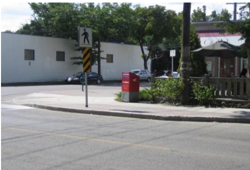
7 th Avenue and Princess Street (City Park Neighbourhood)

Curb extensions can be used on all roadways which have on-street parking. They are often used at midblock crossing locations, in front of schools and at major crosswalk locations.