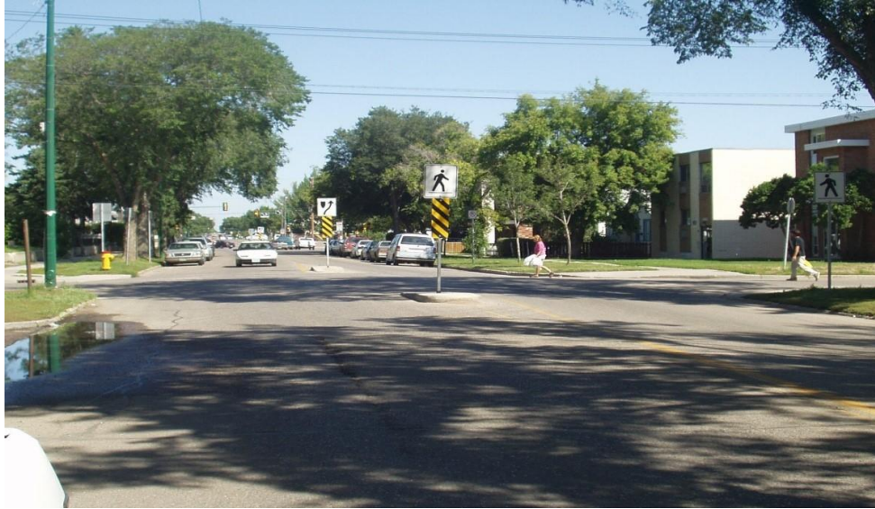
Figure 6.2 Avenue P and 21 st Street (Pleasant Hill Neighbourhood)