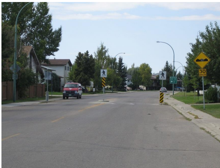
Figure 6.5 Meilicke Road between David Knight Crescent and Stechishin Crescent (Silverwood Heights Neighbourhood)

A raised crosswalk is a marked pedestrian crosswalk at an intersection or mid-block location constructed at a higher elevation than the adjacent roadway. Raised crosswalks may help reduce vehicle speeds and improve pedestrian visibility, thereby reducing pedestrian-vehicle conflicts.