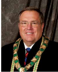
Mayor Donald Atchison