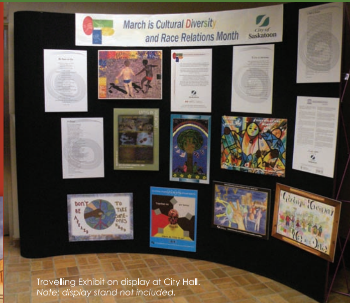
Travelling Exhibit on display at City Hall. Note: display stand not included.