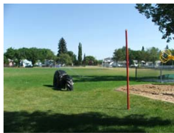
W. W. Ashley Park