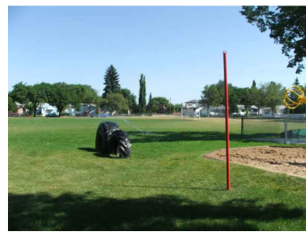
W. W. Ashley Park