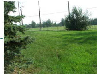
SED Industrial #3