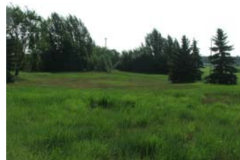
SED Industrial #1