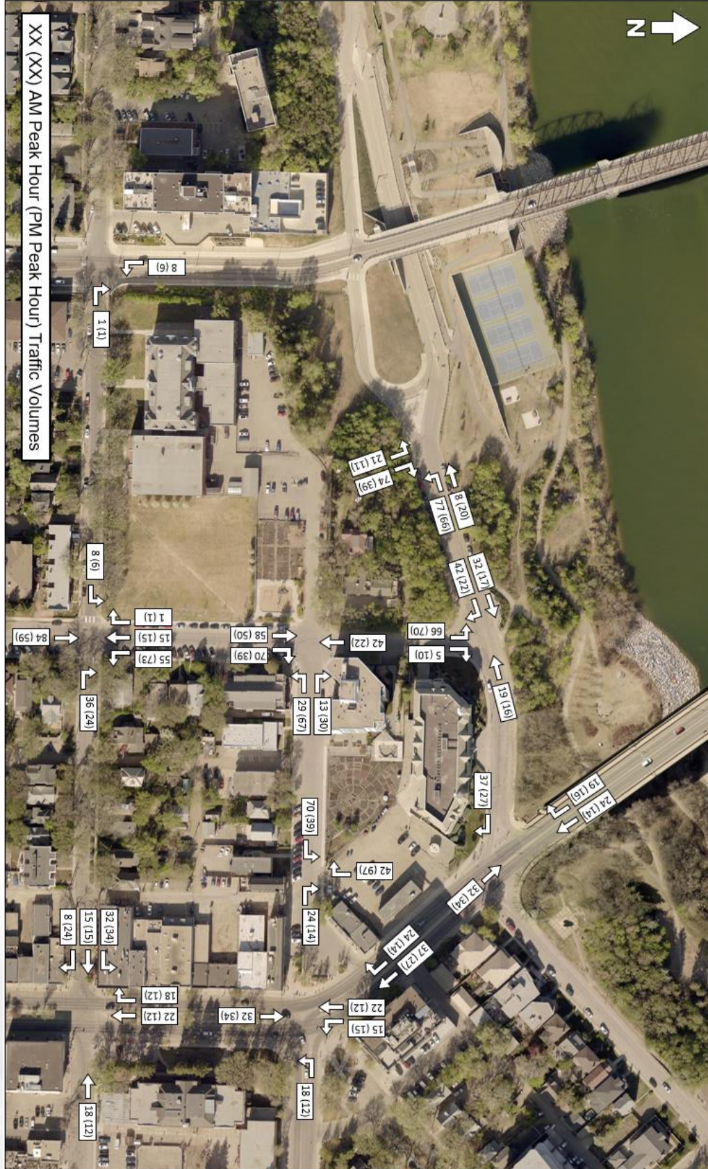
Figure 2: Site Generated Trip Distribution