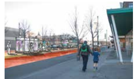
Broadway Ave & Main Street Dedicated Lane Option