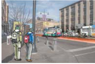
3rd Ave & 20 th St Option