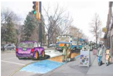
Broadway Ave & 12 th Street Mixed Lane Option