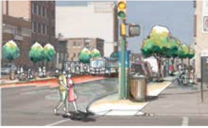
1st Ave & 23 rd St Option

A BRT system offers opportunities to improve the public spaces in locations where it runs, including improved shelters, updated landscaping, street furniture, and more.