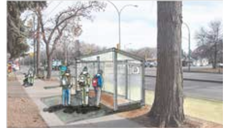
Broadway Ave & 8 th St Option