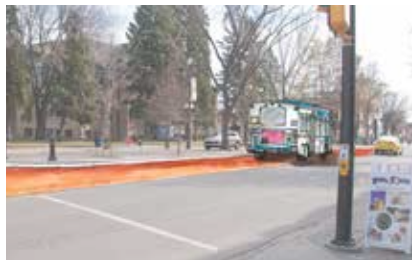
Broadway Ave & 12 th Street Dedicated Lane Option